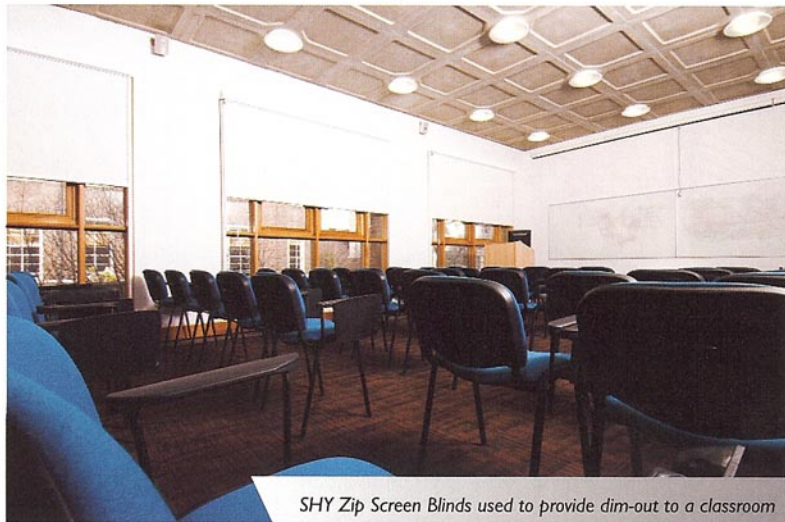
SHY Zip Screen Blinds used to provide dim-out to a classroom